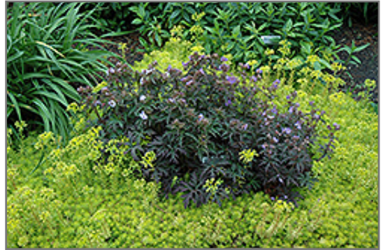
Dark Reiter Cranesbill in bloom