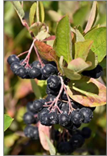
Viking Chokeberry fruit

This shrub should only be grown in full sunlight. It is an amazingly adaptable plant, tolerating both dry conditions and even some standing water. It is not particular as to soil type or pH, and is able to handle environmental salt. It is somewhat tolerant of urban pollution. This particular variety is an interspecific hybrid.