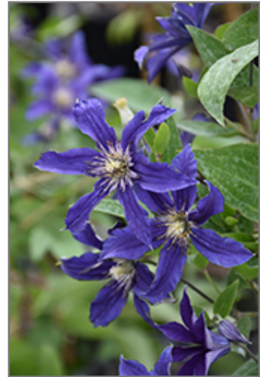
Sapphire Indigo Clematis flowers