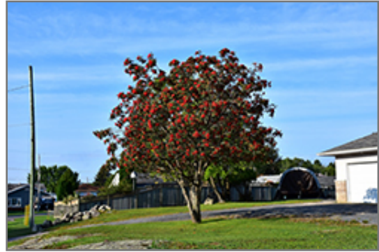
Showy Mountain Ash fruit