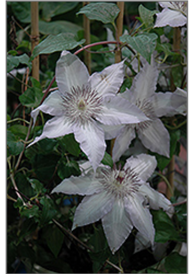
Claire De Lune Clematis flowers