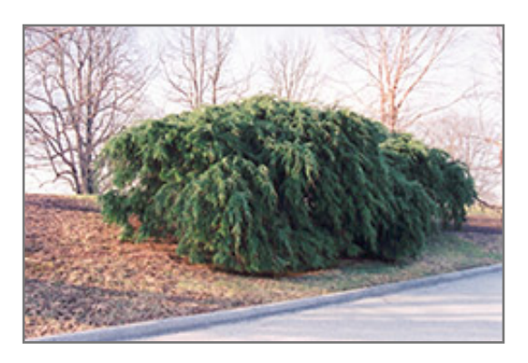
Sargent's Weeping Hemlock

This shrub will require occasional maintenance and upkeep, and is best pruned in late winter once the threat of extreme cold has passed. Gardeners should be aware of the following characteristic(s) that may warrant special consideration;