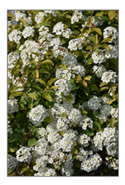
Firegold Spirea flowers

8785 Green Lake Trail Forest Lake, MN 55025 651-462-5554