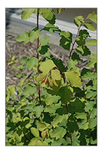
Firegold Spirea foliage

This shrub should only be grown in full sunlight. It prefers to grow in average to moist conditions, and shouldn't be allowed to dry out. It is not particular as to soil type or pH. It is highly tolerant of urban pollution and will even thrive in inner city environments. This particular variety is an interspecific hybrid.