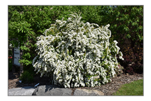
Firegold Spirea in bloom

This is a relatively low maintenance shrub, and should only be pruned after flowering to avoid removing any of the current season's flowers. It is a good choice for attracting butterflies to your yard, but is not particularly attractive to deer who tend to leave it alone in favor of tastier treats. It has no significant negative characteristics.