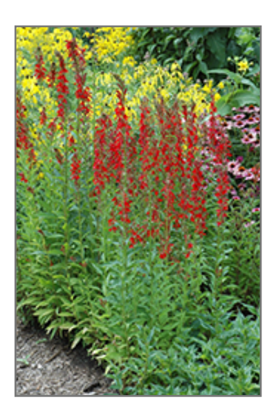
Cardinal Flower in bloom