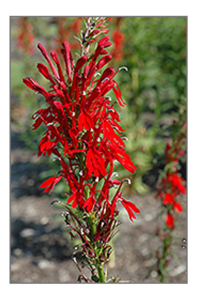
Cardinal Flower flowers