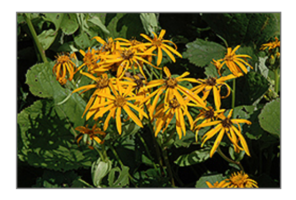
Othello Rayflower flowers