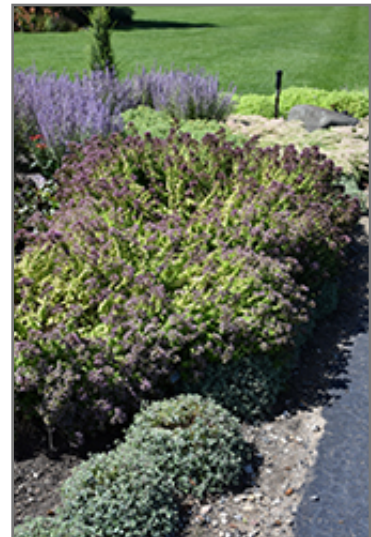
Drops of Jupiter Oregano in bloom