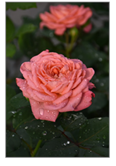
Reminiscent Coral Rose flowers