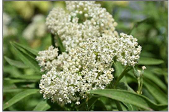
Ice Ballet Milkweed flowers

Ice Ballet Milkweed is recommended for the following landscape applications;