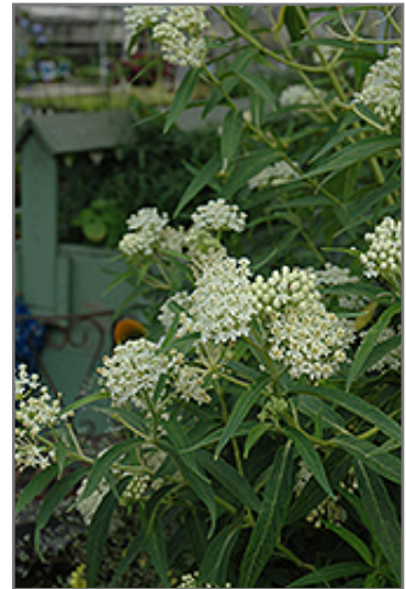
Ice Ballet Milkweed flowers