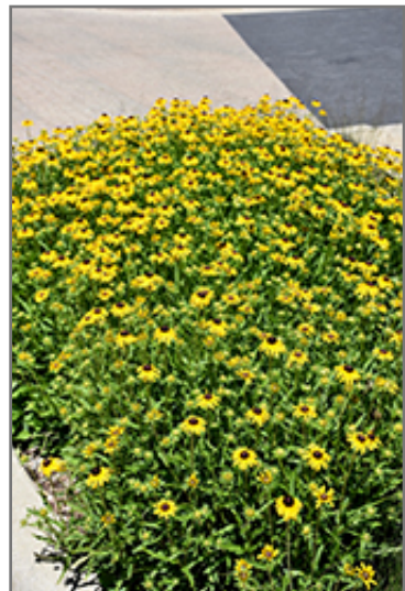
Viette's Little Suzy Coneflower in bloom