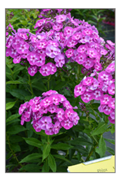
Laura Garden Phlox flowers

Laura Garden Phlox features bold fragrant conical lilac purple star-shaped flowers with white eyes at the ends of the stems from early summer to early fall. The flowers are excellent for cutting. Its narrow leaves remain green in color throughout the season.