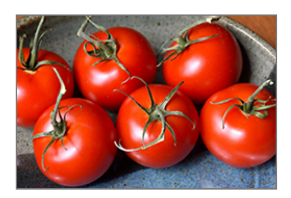
Patio Tomato fruit

Patio Tomato will grow to be about 24 inches tall at maturity, with a spread of 24 inches. When planted in rows, individual plants should be spaced approximately 24 inches apart. Because of its vigorous growth habit, it may require staking or supplemental support. This fast-growing vegetable plant is an annual, which means that it will grow for one season in your garden and then die after producing a crop.