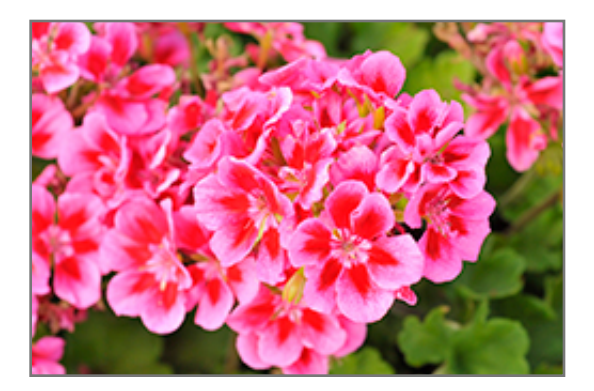
Calliope Medium Rose Mega Splash Geranium flowers