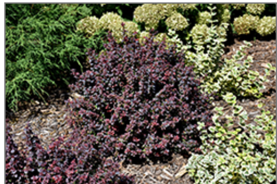
Sunjoy Todo Japanese Barberry