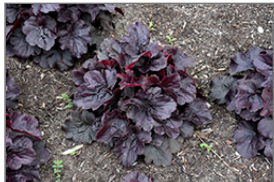
Northern Exposure Black Coral Bells