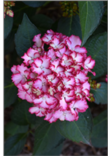
Seaside Serenade Fire Island Hydrangea flowers