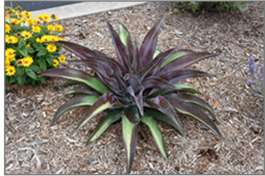
Mission to Mars Mangave

Mission to Mars Mangave is recommended for the following landscape applications;