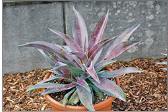
Mission to Mars Mangave

Mission to Mars Mangave will grow to be about 10 inches tall at maturity, with a spread of 22 inches. It grows at a fast rate, and under ideal conditions can be expected to live for approximately 5 years. As an herbaceous perennial, this plant will usually die back to the crown each winter, and will regrow from the base each spring. Be careful not to disturb the crown in late winter when it may not be readily seen!