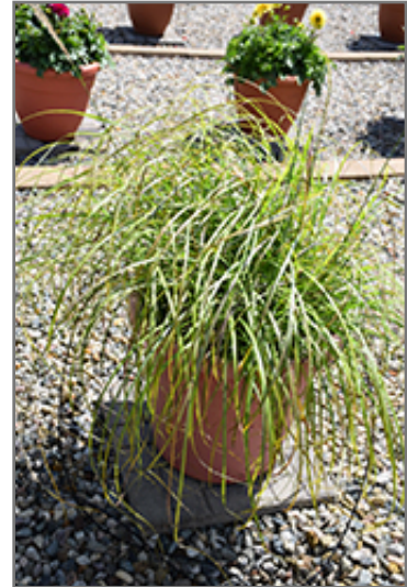
Little Miss Maiden Grass