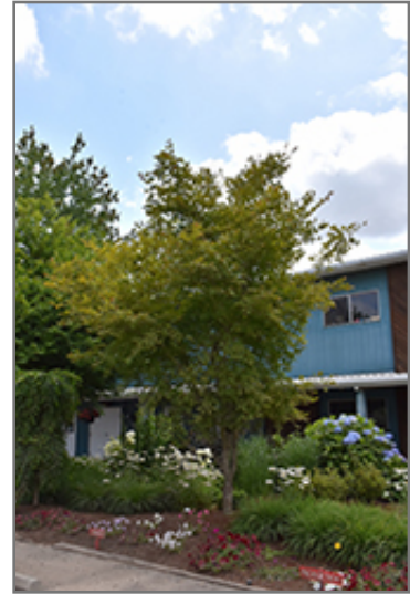
Northern Glow Maple

This tree does best in full sun to partial shade. It does best in average to evenly moist conditions, but will not tolerate standing water. It is not particular as to soil type or pH. It is somewhat tolerant of urban pollution. This particular variety is an interspecific hybrid.