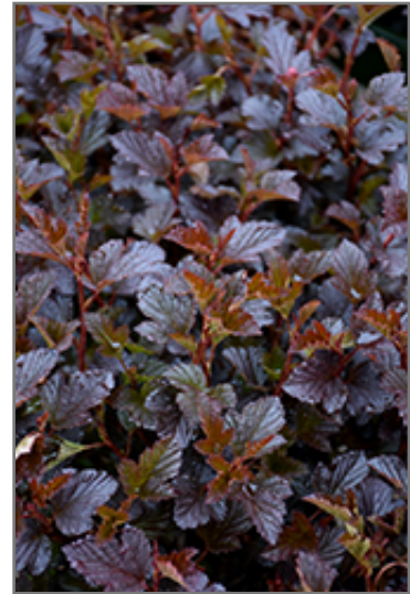
Petite Plum Ninebark foliage