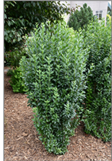
Straight Talk Privet