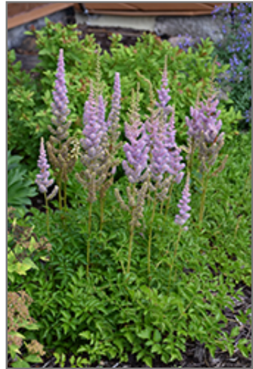
Dwarf Chinese Astilbe in bloom