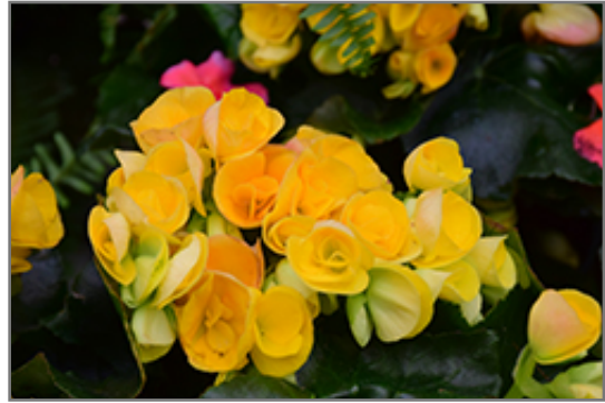
Nadine Begonia flowers

Nadine Begonia is recommended for the following landscape applications;