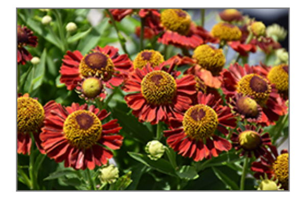
Mariachi Salsa Sneezeweed flowers

8785 Green Lake Trail Forest Lake, MN 55025 651-462-5554