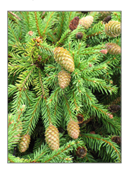
Pusch Spruce foliage