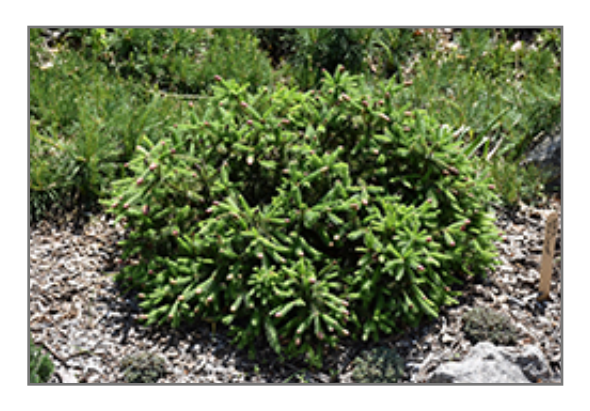
Pusch Spruce