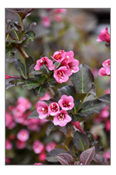
Tango Weigela flowers

Tango Weigela is recommended for the following landscape applications;