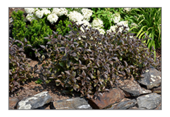
Tango Weigela

This shrub should only be grown in full sunlight. It prefers to grow in average to moist conditions, and shouldn't be allowed to dry out. It is not particular as to soil type or pH. It is highly tolerant of urban pollution and will even thrive in inner city environments. This is a selected variety of a species not originally from North America.