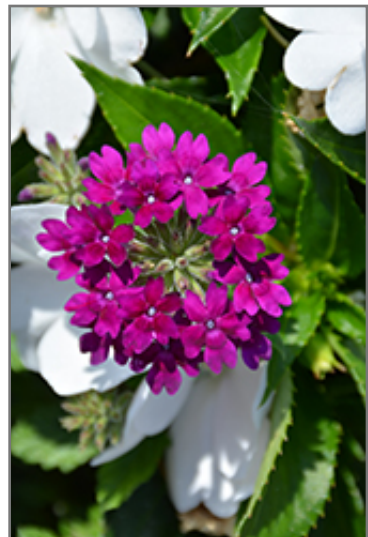
Superbena Royale Plum Wine Verbena flowers