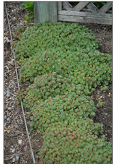
Lime Zinger Stonecrop

Lime Zinger Stonecrop will grow to be only 4 inches tall at maturity extending to 6 inches tall with the flowers, with a spread of 18 inches. When grown in masses or used as a bedding plant, individual plants should be spaced approximately 15 inches apart. Its foliage tends to remain low and dense right to the ground. It grows at a fast rate, and under ideal conditions can be expected to live for approximately 15 years. As an herbaceous perennial, this plant will usually die back to the crown each winter, and will regrow from the base each spring. Be careful not to disturb the crown in late winter when it may not be readily seen!