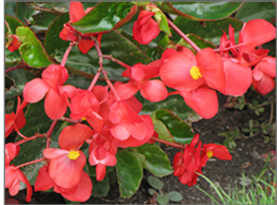
Dragon Wing Red Begonia flowers

Dragon Wing Red Begonia is an herbaceous annual with a trailing habit of growth, eventually spilling over the edges of hanging baskets and containers. Its medium texture blends into the garden, but can always be balanced by a couple of finer or coarser plants for an effective composition.