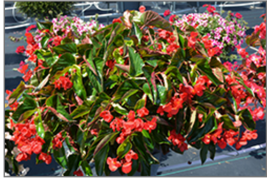
Dragon Wing Red Begonia in bloom

Dragon Wing Red Begonia is a fine choice for the garden, but it is also a good selection for planting in outdoor containers and hanging baskets. Because of its trailing habit of growth, it is ideally suited for use as a 'spiller' in the 'spiller-thriller-filler' container combination; plant it near the edges where it can spill gracefully over the pot. Note that when growing plants in outdoor containers and baskets, they may require more frequent waterings than they would in the yard or garden.