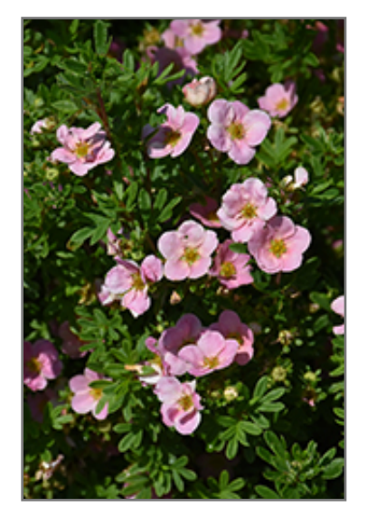
Pink Beauty Potentilla flowers

This is a relatively low maintenance shrub, and is best pruned in late winter once the threat of extreme cold has passed. It is a good choice for attracting butterflies to your yard, but is not particularly attractive to deer who tend to leave it alone in favor of tastier treats. It has no significant negative characteristics.